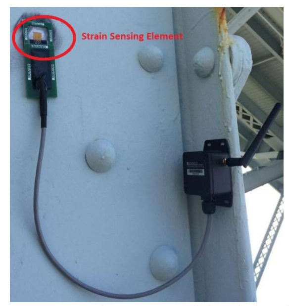
Figure 2: SenSpot™ steel strain gauge installed on a bridge web

Another important factor that must be taken in to account, is the environment relative humidity (RH). The strain gauge adhesive needs humidity for proper curing. If RH is less than 40%, then it cannot be cured fully and this degrades bonding of strain gauge and steel. As a result, the measurement accuracy reduces. So, before installation, make sure RH is at least 40%.