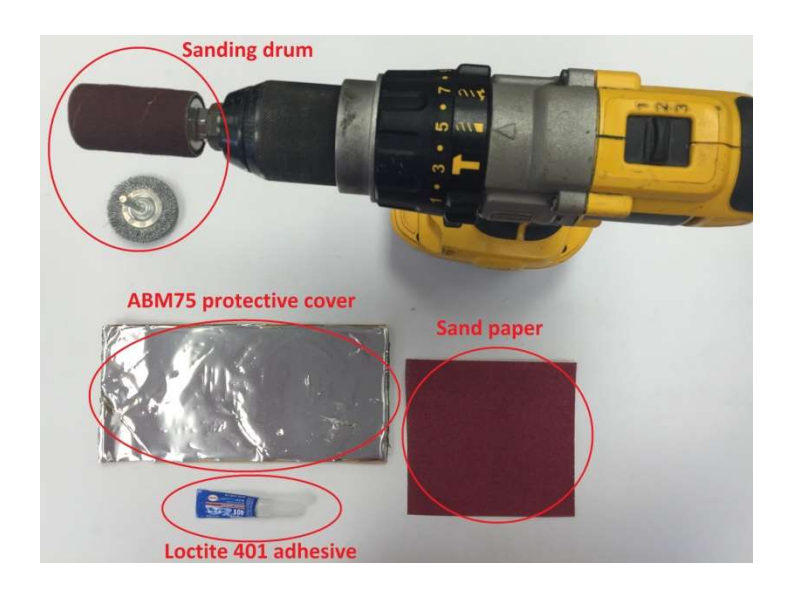
Figure 1: Tools required for installing SenSpot™ steel strain gauge

Typically, cold cured adhesive and ABM75 protective cover are provided by Resensys to the customer along with SenSpot<sup>™</sup> steel strain gauge. Other items such as sanding drum and drill or sand paper and wiping tissues can be purchased from any local hardware store.